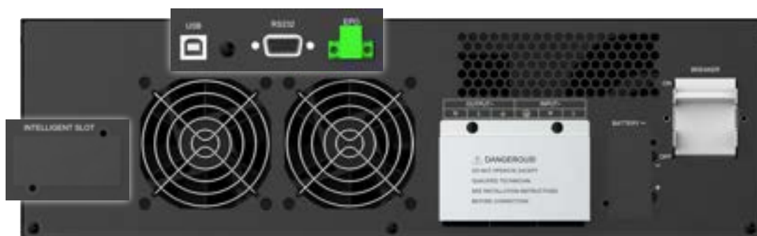
HID and smart slots can be found on Cronus Pro 6KR and other Cronus Pro Rackmount series

Manage your power smartly by connecting to any HIDs (Human Interface Devices) such as a USB port or RS232 and a smart slot for optional Mini-wifi CMCARD-CW, SNMP CARD and Mini-ETH CMCARD-E