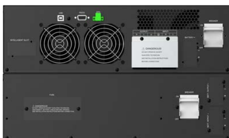
Cronus Pro 6KR & Cronus Pro 10KR