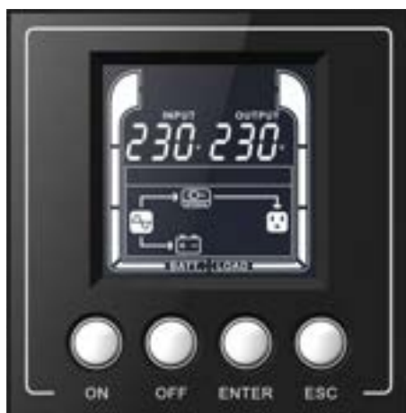
Cronus Pro series LCD display

Allows easy monitoring and control experience of the UPS parameters.