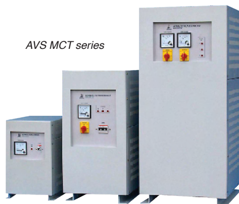
AVS MCT series

Users using this option can reduce the noise in power or any electromagnetic interference from the input power during their usage.