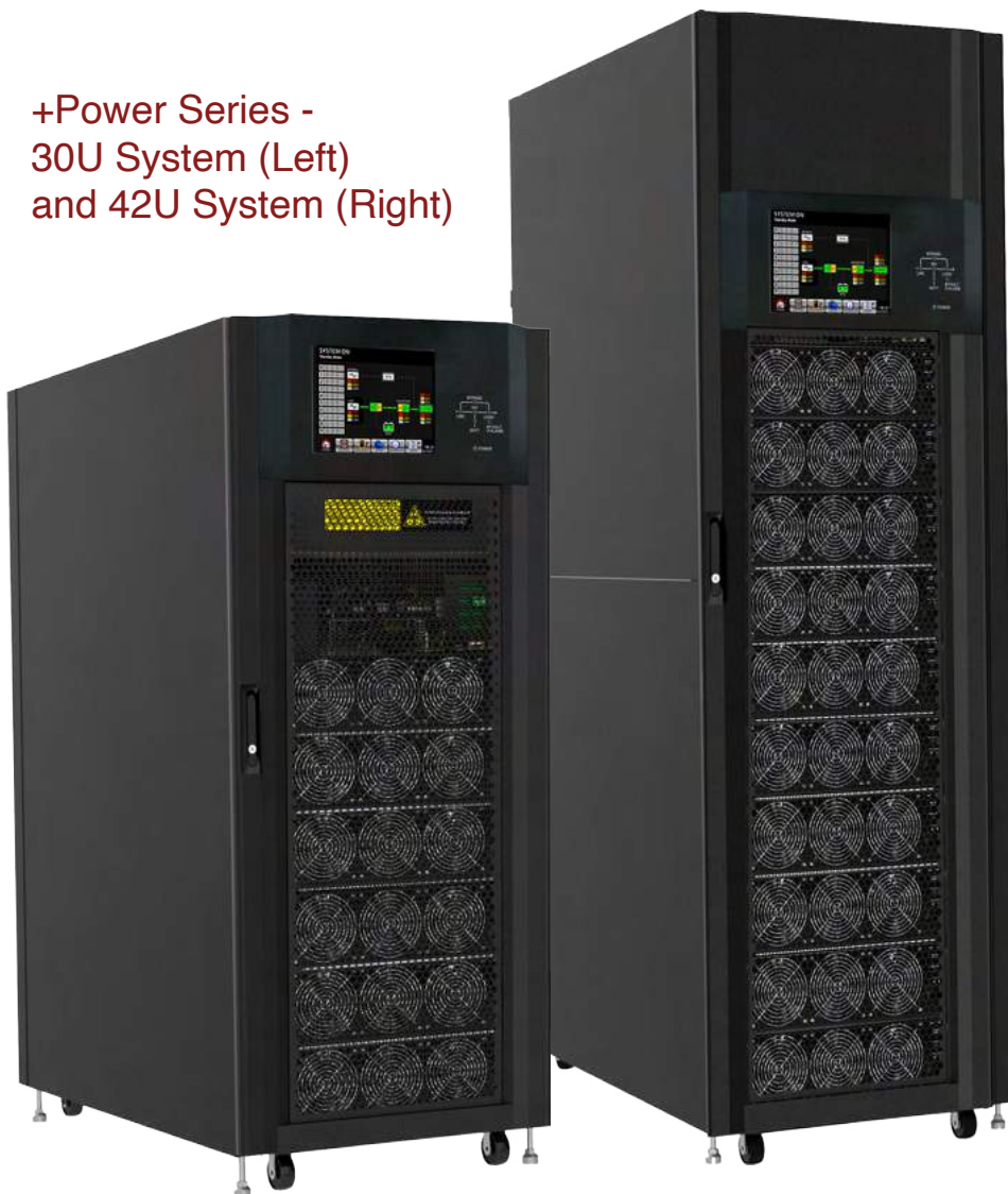
+Power Series - 30U System (Left) and 42U System (Right)

Comes in two sizes, highly convenient features and a variety of power ratings to provide a versatile power protection solution.