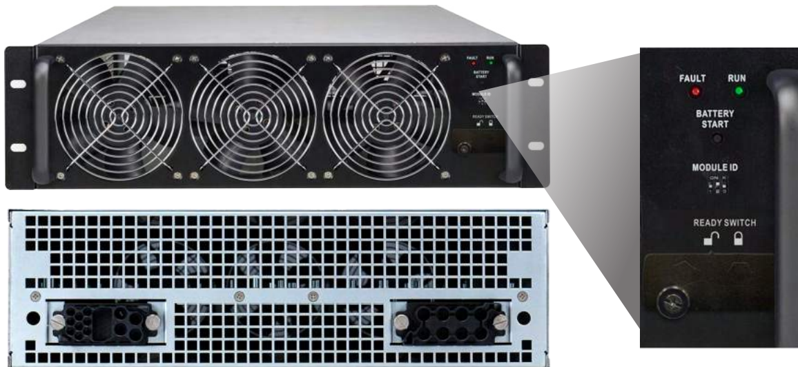
Front (top) and back (bottom) view of Power Module for +Power series.