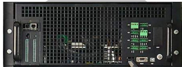
Control panel of +Power 30U system (top) and build-in smart communication port inside +Power models (bottom)