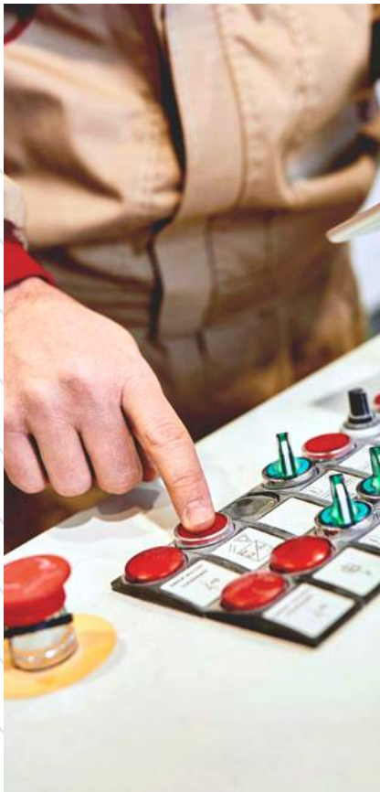
CRITICAL MISSION APPLICATION

The goodness of +Power does not end here, all the critical features of a well-built modular UPS in terms of UPS monitoring, hot-swappable mechanism, and UPS exterior protection are all further enhanced with innovative designs creating the perfect UPS solution for any critical applications on the planet.