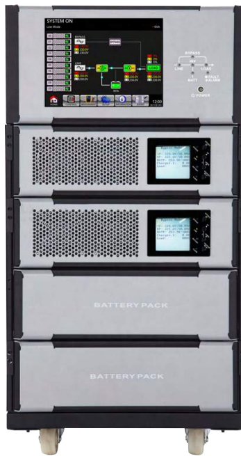
Complete Arena Series with Chassis, Power Module and Battery Module