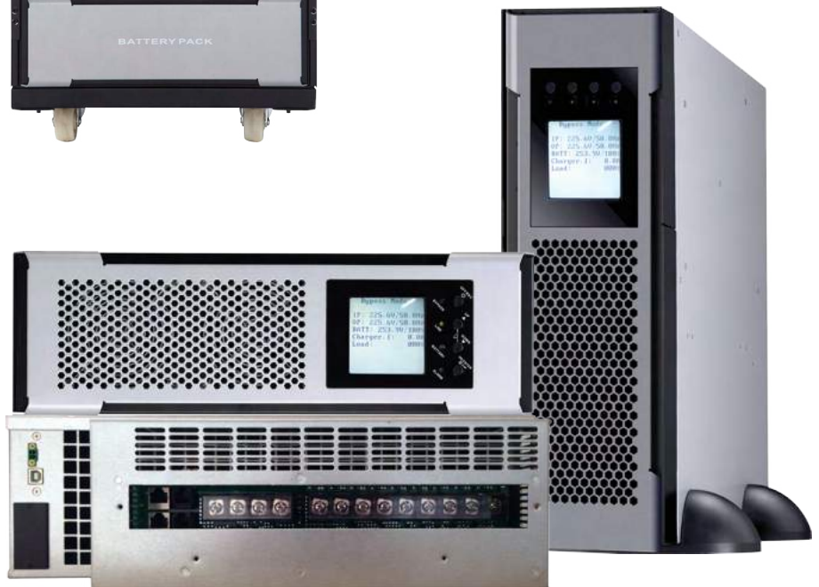
Stand Alone Arena Power Module