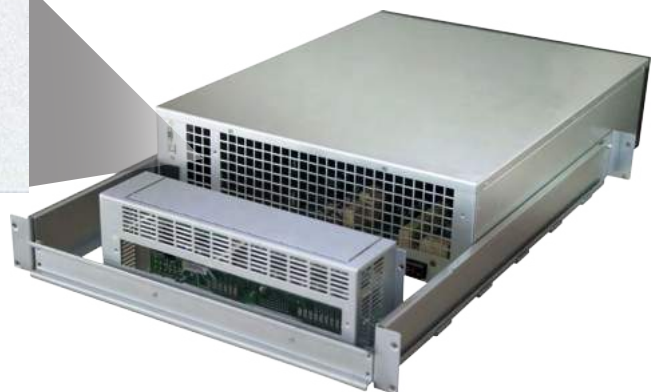
Rear view of Arena Series's Power Module and Connector Box (Right).