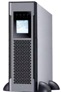
Stand Alone Arena Power Module (Bottom).