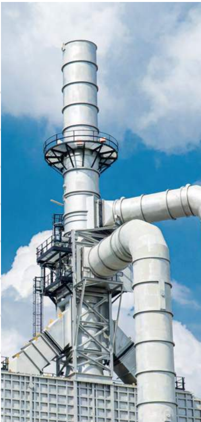
MISSION CRITICAL APPLICATION

The series does not just focus on the ease of installation Neuropower's Arena Series' versatility goes beyond by making sure it is constructed using carefully picked components and technology for the best possible reliability in power protection for critical applications. The Arena Series is just so much fun and convenient to use because users do not need to be limited by any external physical factors such as space storage, etc. Yet, they can enjoy all the incredible benefits a modular UPS has to offer.