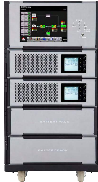
Complete Arena Series with Chassis, Power Module and Battery Module Front View (Left).

Perfect for critical applications, this feature ensures users with a high output performance from the UPS at a high power efficiency (up to 97% with output power factor 1.0).