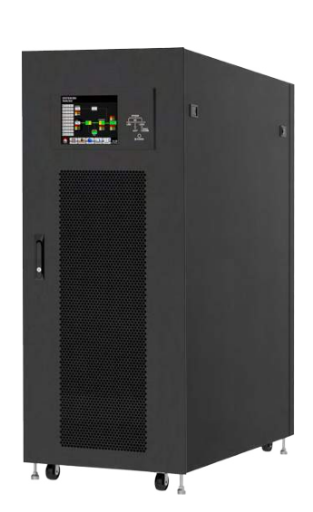
+Power A series 120kVA & 180kVA