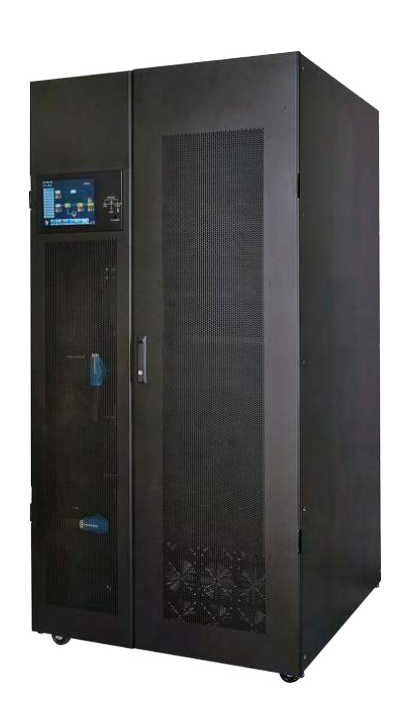
+Power A series 500kVA & 600kVA

This UPS comes with highly convenient features and a variety of power ratings to provide a versatile power protection solution.