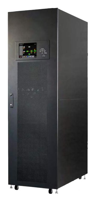
+Power A series 300kVA & 420kVA