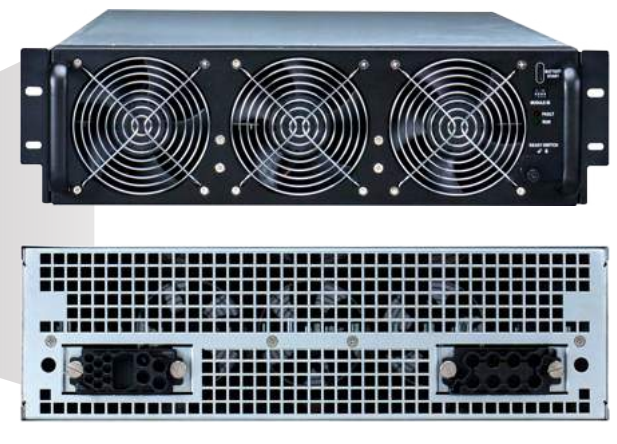
Power module's front and rear view (top to bottom)