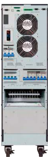
Galleon Pro III 10K - 20K

Comes in a variety of sizes, user friendly components and power rates to provide a versatile power protection solution.