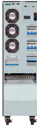
Galleon Pro III 30K - 60K