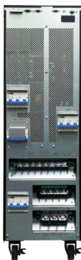
Galleon Pro III 80K - 200K