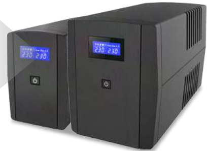
Side view of City-USB and City-i